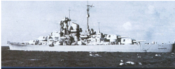
Wartime colour photograph of the Bismarck at sea

In July 1940 the remnants of the squadron were augmented to 9 aircraft and embarked on HMS Furious for operations in September including night attacks on Trondheim and Tromso.