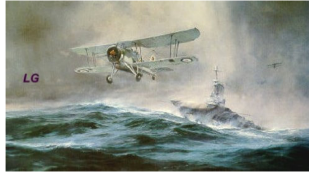
Swordfish of 825 sqdn being launched against the German battleship Bismarck (painting by R Taylor)