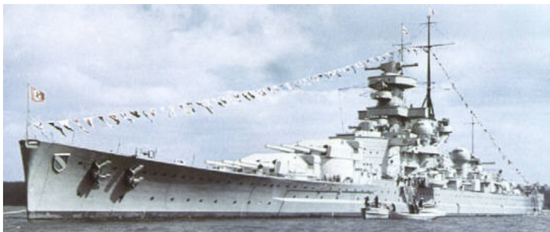
Wartime colour photograph on the Scharnhorst

From June 1941 the Squadron embarked on HMS Ark Royal for Malta convoy duties, and in September was involved in attacking targets in Pantellaria, Sardinia and Sicily. When HMS Ark Royal was torpedoed on 13 November 1941 the remnants of the squadron flew to Gibraltar and ceased to exist.